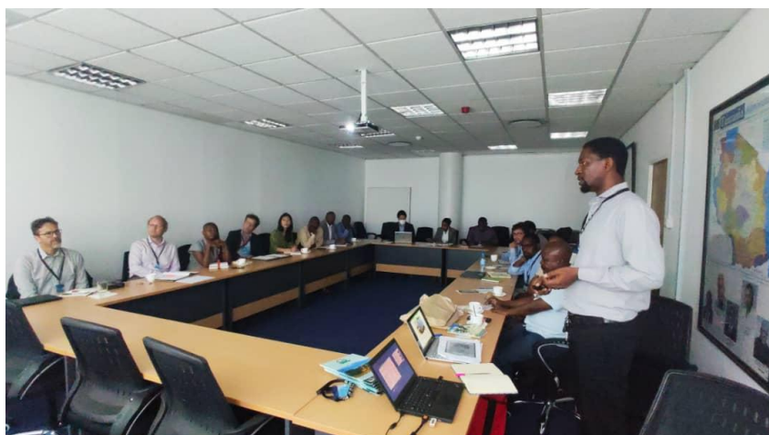
Presentation of TaTEDO works including eCook initiatives to E-DPs in Dar es Salaam