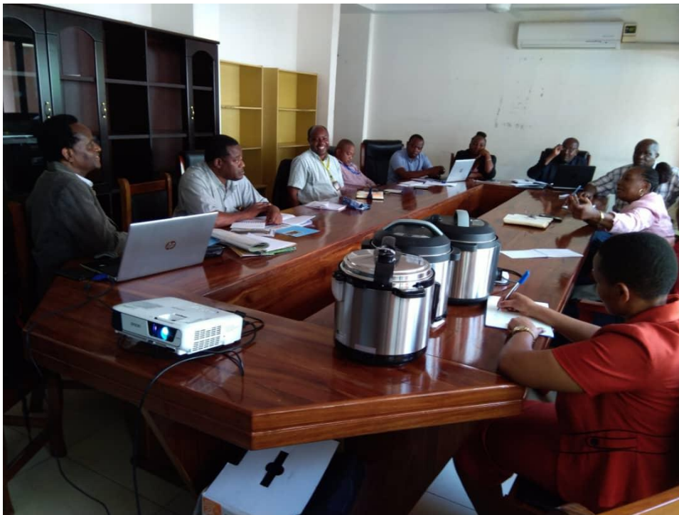
A meeting with Officers from President Office (PRO-RALG) in Dodoma